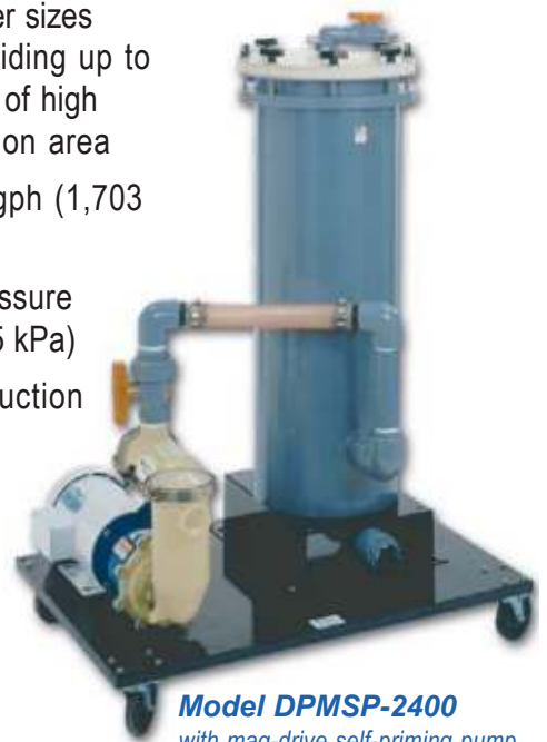
Model DPMS-2400 with mag-drive self-priming pump